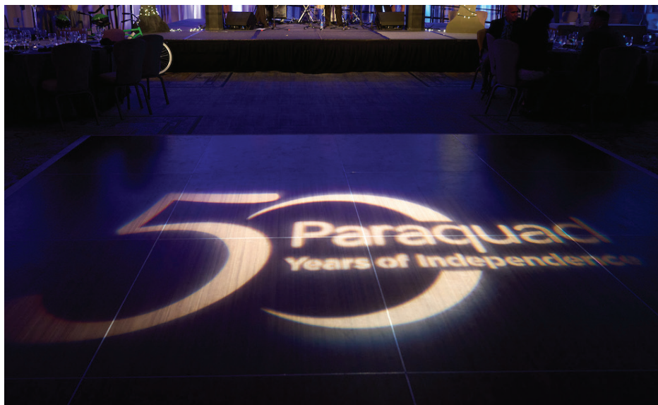
The 50th Anniversary logo shines during the Shine the Light Jubilee.

Government Services Analyst, City of St. Louis