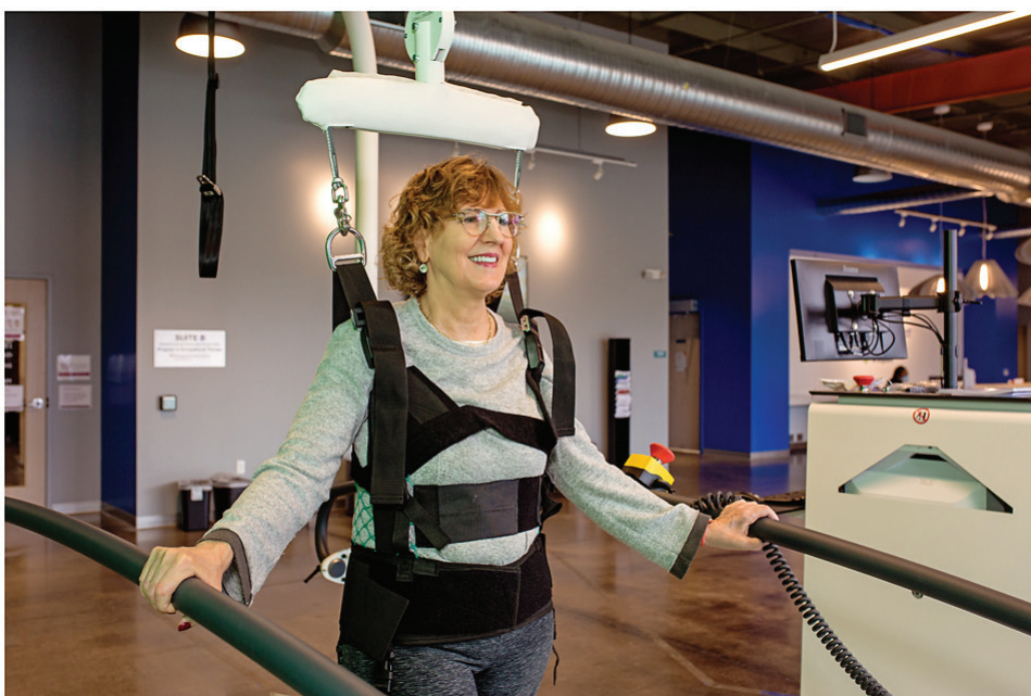
A participant works out at the Orthwein Center.