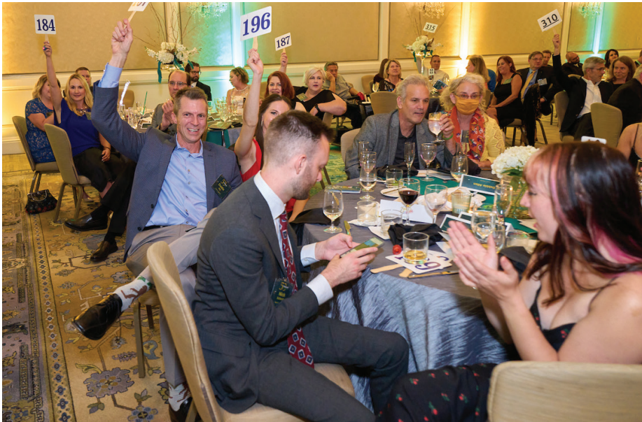
2021 Shine the Light Jubilee