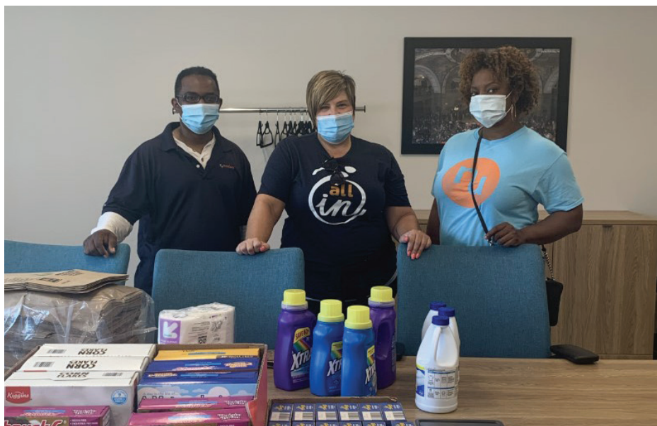
Paraquad team members sort donations for delivery to participants during the Covid pandemic.