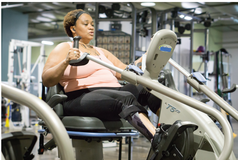
A participant works out at the Orthwein Center.